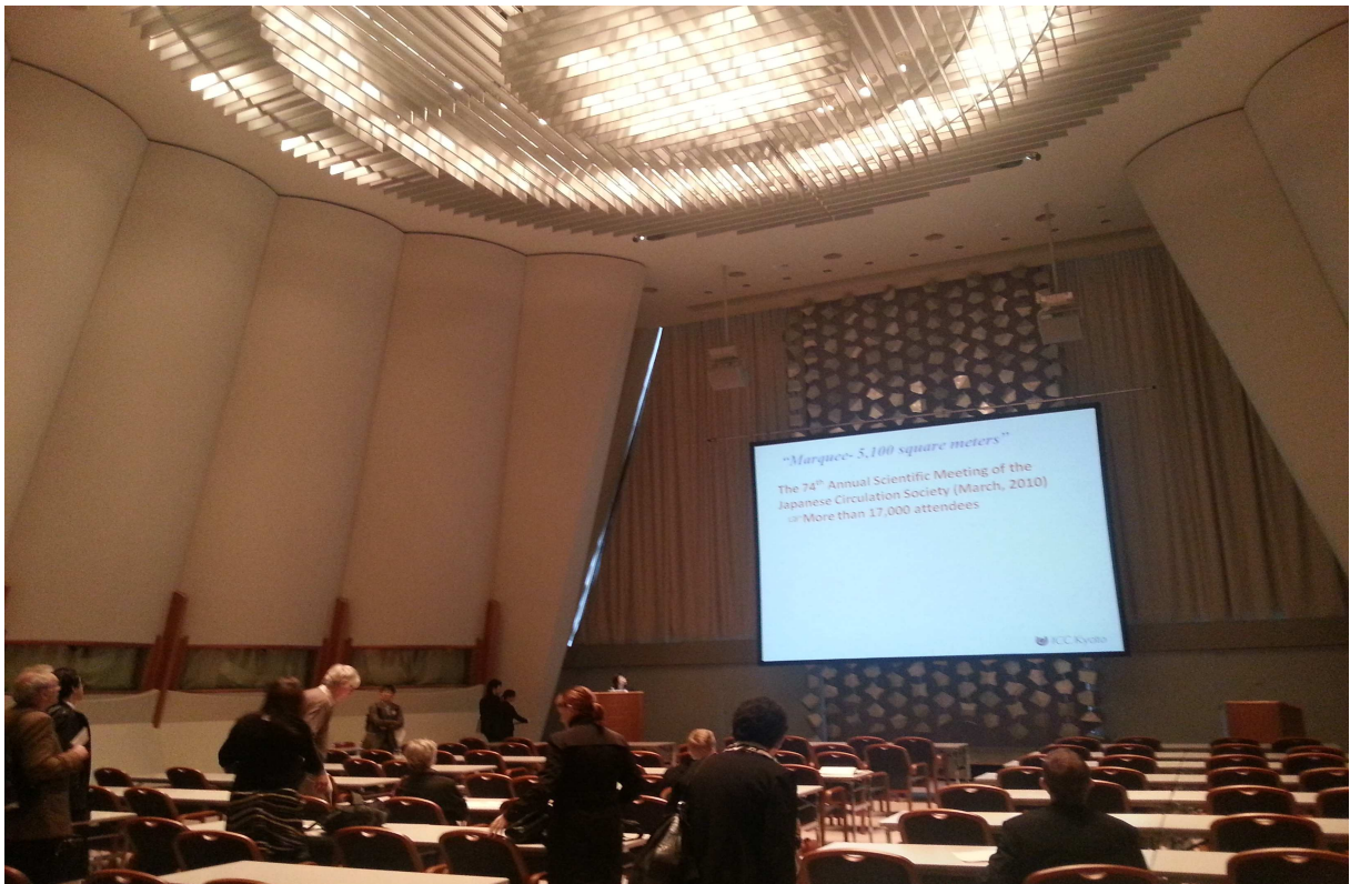
Photo 2: IEHA EC members testing the facilities in one of the conference rooms.